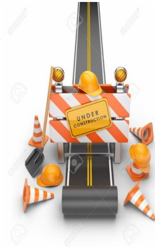
Figure 2: Commence Construction

On April 20, 2017, five (5) bids were received and reviewed for the North Vermont Street Redevelopment project. ALTO Construction Co., Inc. was the lowest responsive and responsible bid at $697,067.00. The Construction Budget for this project is $735,000. On May 8, 2017, the City Commission authorized the City Manager to execute a Construction Contract with ALTO Construction. A Pre-Construction Meeting was held on June 5, 2017, and Notice To Proceed was issued effective June 19, 2017. ALTO has started construction on schedule (Figure 2). During the week of June 19 the contractor's staging area was established and construction materials and equipment have been mobilized. The construction site was designated by installation of warning, regulation and informational road signs. Additional traffic control measures such as variable message boards on Baker Street to notify drivers of road closures, temporary barricades (Figure 3) and flagmen on the road can be expected within the vicinity of the Vermont Street project. Construction progress to expect: during June-July the contractor will perform site preparation for construction by clearing/grubbing and demolition work, then underground utility work, which includes the installation of a new 6" water main on the east side of the roadway and a new sanitary sewer system under Vermont Street, will be performed. The roadway base will be rebuilt between Tomlin & Calhoun Street.