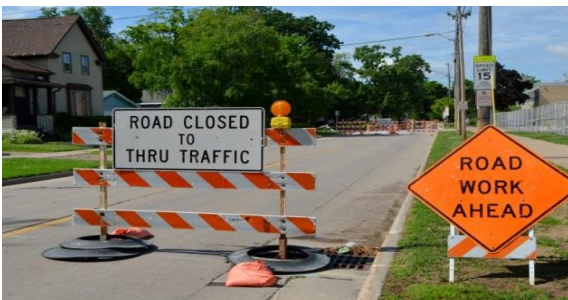
Figure 3: Road Work Ahead & Temporary Barricades

During mid July - August, installation of a new stormwater/drainage system will be performed on the west side of Vermont Street between Tomlin and Herrings Street. What to expect during construction: • Maintenance of traffic (plan enclosed with this Newsletter) will be provided throughout the construction period • Heavy construction trucks, excavators, bulldozers, wheel loaders and other equipment will be entering and exiting the streets within the project area. Be aware and keep a safe distance from all construction activities.